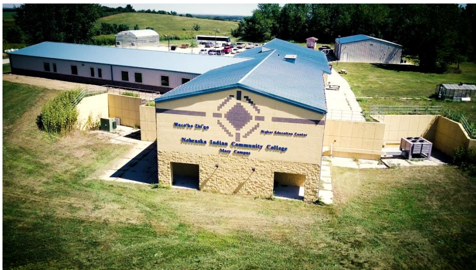
NICC Macy Campus with the finished North wing.