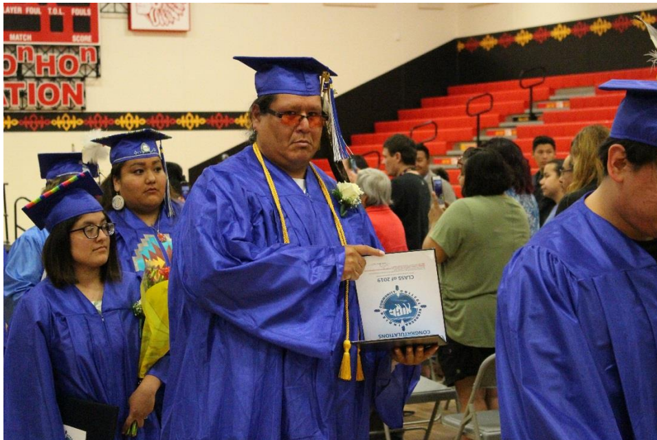
Graduation 2019 at Umo'ho' Nation Public School

The college is associated with the following institutions: American Indian Higher Education Consortium, Nebraska Post-Secondary Coordinating Commission, the Council for Opportunities in Education, National Aeronautics and Space Administration, Kellogg Foundation, American Indian College Fund, University of Nebraska-Lincoln, University of Nebraska Omaha, University of Nebraska Kearney, University of Iowa, Iowa State University, Waldorf College, South Dakota State University, North Dakota State University, University of South Dakota, Morningside College, Dakota Alliance, The Nebraska Transfer Initiative, Bureau of Indian Affairs, Bureau of Indian Education, United States Department of Agriculture, Housing and Urban Development, Department of Education, Nebraska Community College Association, Nebraska Early Childhood Education Partnership, The League for Innovation in the Community College, National Indian Education Association, and American Distance Education Consortium (ADEC).