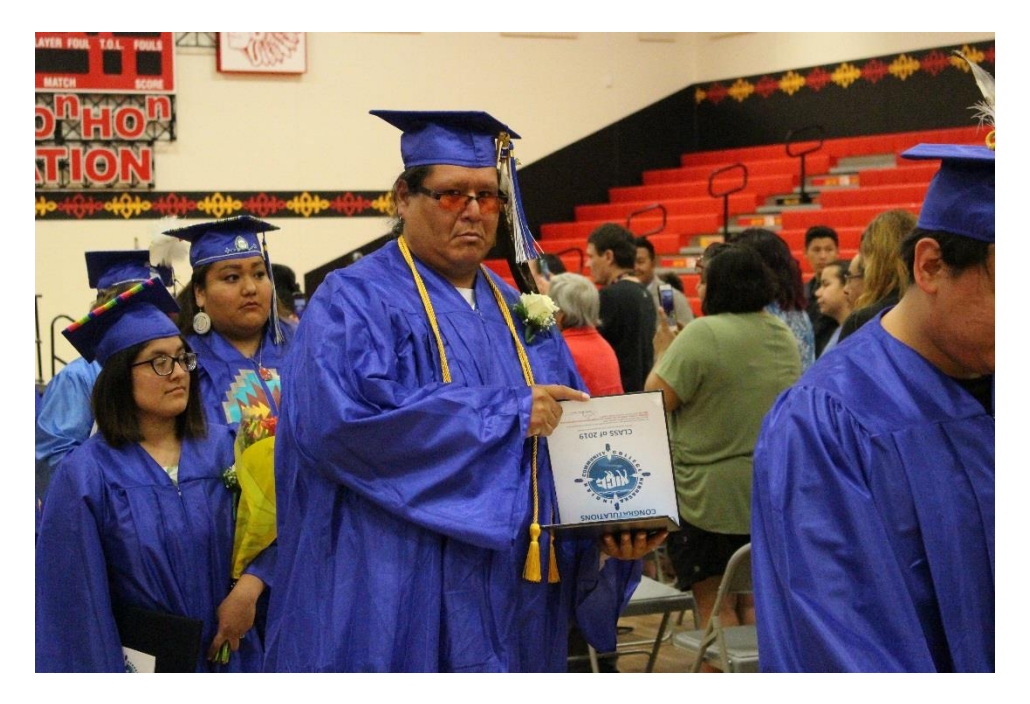
Graduation 2019 at Umonhon Nation Public School

The college is associated with the following institutions: American Indian Higher Education Consortium, Nebraska Post-Secondary Coordinating Commission, the Council for Opportunities in Education, National Aeronautics and Space Administration, Kellogg Foundation, American Indian College Fund, University of Nebraska-Lincoln, University of Nebraska Omaha, University of Nebraska Kearney, University of Iowa, Iowa State University, Waldorf College, South Dakota State University, North Dakota State University, University of South Dakota, Morningside College, Dakota Alliance, The Nebraska Transfer Initiative, Bureau of Indian Affairs, Bureau of Indian Education, United States Department of Agriculture, Housing and Urban Development, Department of Education, Nebraska Community College Association, Nebraska Early Childhood Education Partnership, The League for Innovation in the Community College, National Indian Education Association, and American Distance Education Consortium (ADEC).