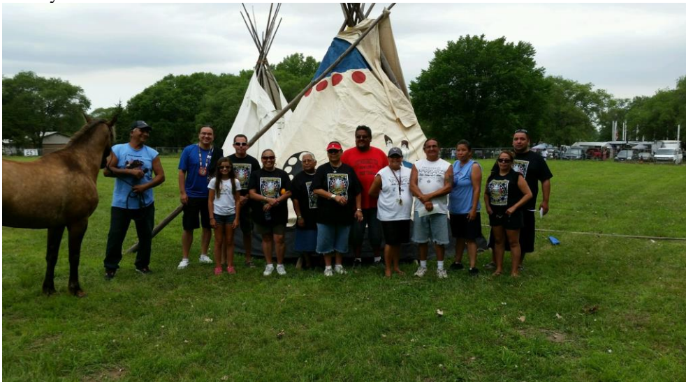
Ultimate Warriors at Santee, Nebraska during the Santee Pow wow of 2016.

In order to receive a second AA or AS degree, a student must have completed the core requirements in general education for the degree sought and the requirements in the new concentration area, including a minimum of 15 semester credits beyond the first degree. Financial aid may be available and will be assessed on an individual basis. Second Degrees will be charged the same fees as first degrees. If a student has attained two Associate Degrees at NICC, any additional degrees must be approved by Academic Dean.