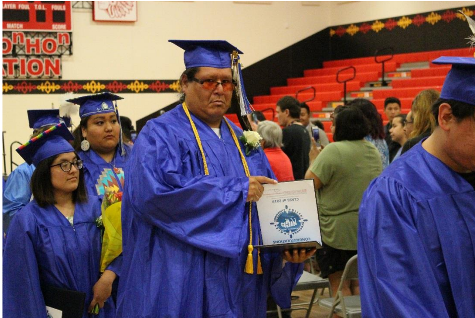
Graduation 2019 at Umo ho Nation Public School

The college is associated with the following institutions: American Indian Higher Education Consortium, Nebraska Post-Secondary Coordinating Commission, the Council for Opportunities in Education, National Aeronautics and Space Administration, Kellogg Foundation, American Indian College Fund, University of Nebraska-Lincoln, University of Nebraska Omaha, University of Nebraska Kearney, University of Iowa, Iowa State University, Waldorf College, South Dakota State University, North Dakota State University, University of South Dakota, Morningside College, Dakota Alliance, The Nebraska Transfer Initiative, Bureau of Indian Affairs, Bureau of Indian Education, United States Department of Agriculture, Housing and Urban Development, Department of Education, Nebraska Community College Association, Nebraska Early Childhood Education Partnership, The League for Innovation in the Community College, National Indian Education Association, and American Distance Education Consortium (ADEC).