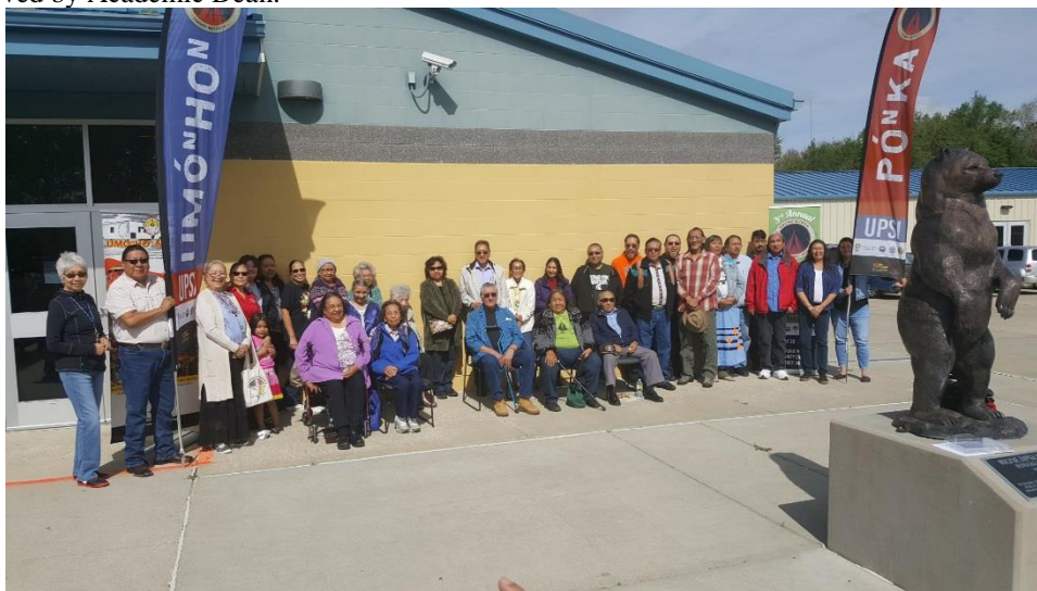
2019 Umo'ho n and Po n ka Language Gathering

In order to receive a second AA or AS degree, a student must have completed the core requirements in general education for the degree sought and the requirements in the new concentration area, including a minimum of 15 semester credits beyond the first degree. Financial aid may be available and will be assessed on an individual basis. Second Degrees will be charged the same fees as first degrees. If a student has attained two Associate Degrees at NICC, any additional degrees must be approved by Academic Dean.