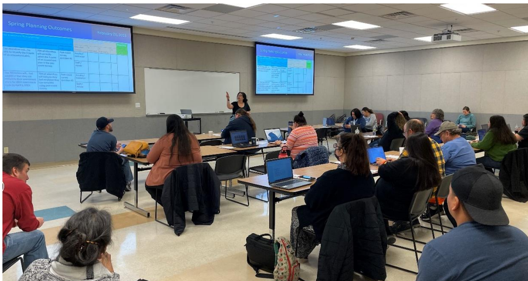
All-Staff meeting held in Macy Auditorium in February 2023