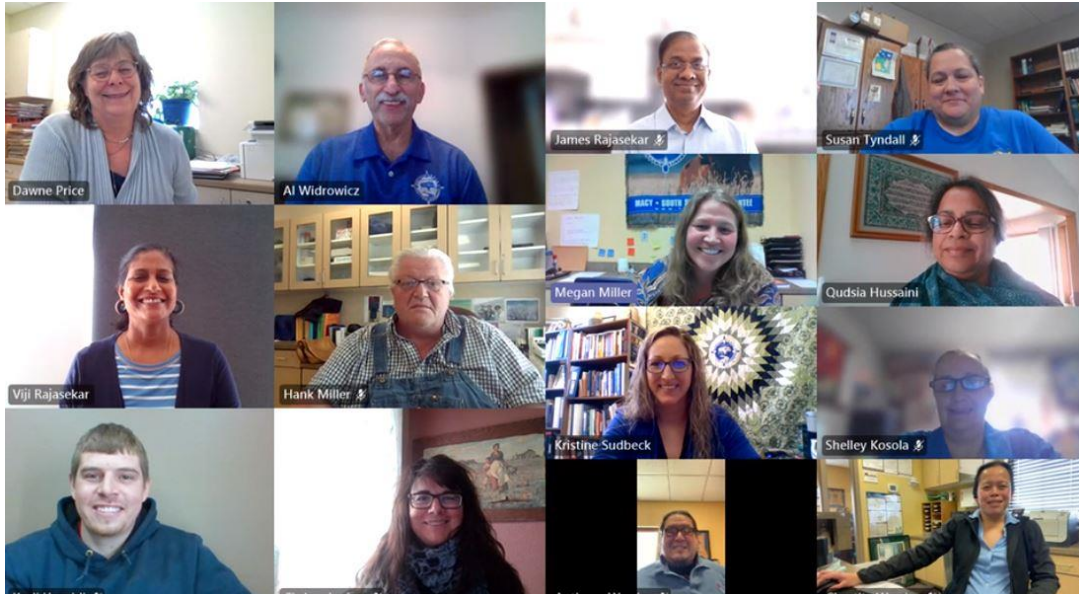
NICC wore blue and celebrated Autism Awareness Week Virtually 2021