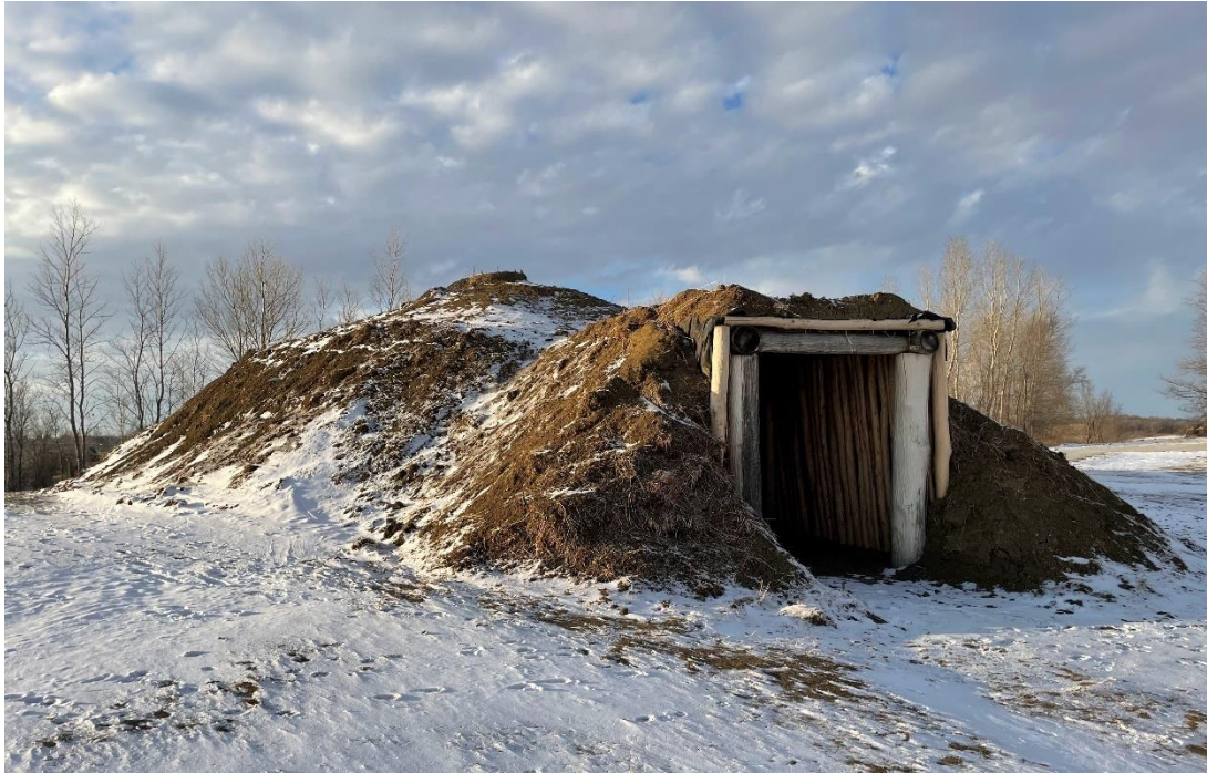
Earth Lodge at Macy Campus