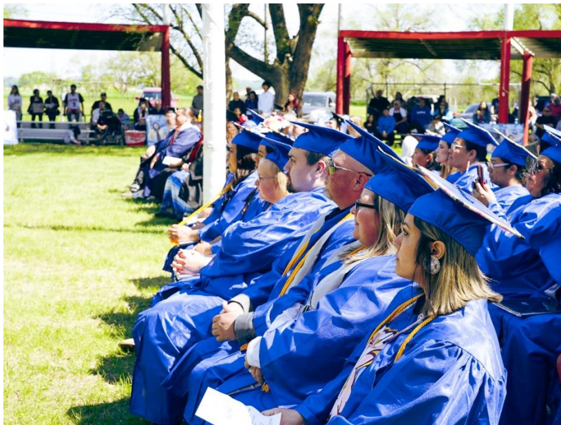
2023 Graduating Class in Santee

NC - No credit: This grade option is not calculated into the GPA. (See section "AUDITS" for more detailed information)