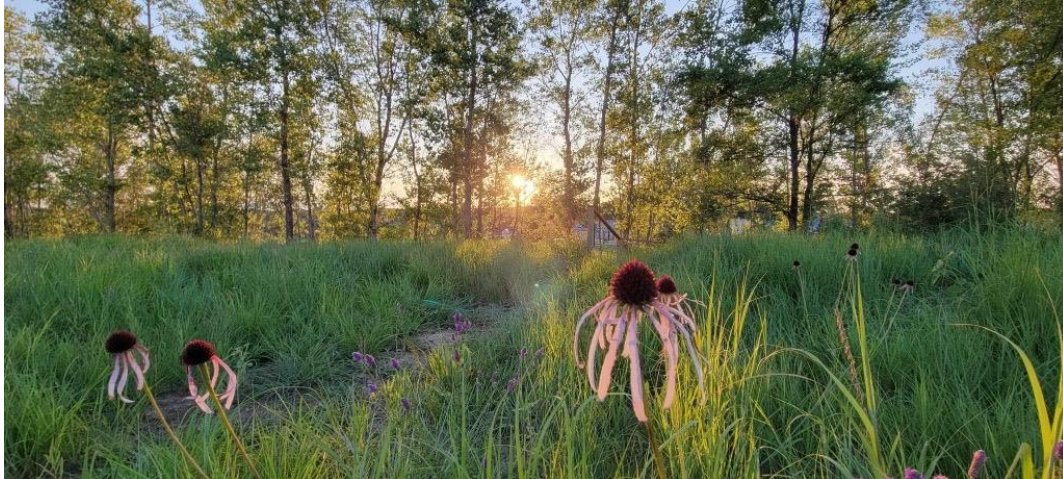
Wildflowers in the Native Prairie