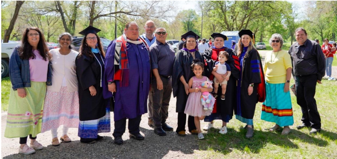
NICC Faculty, Staff, Administration, and Family at 2023 Graduation Ceremony