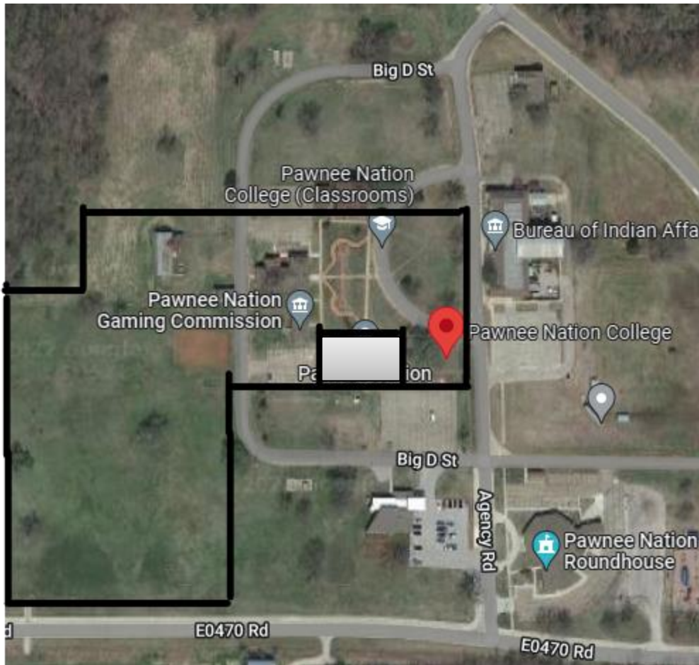
Pawnee Nation College Geography- The gray box is owned by Pawnee Nation and not part of the college.