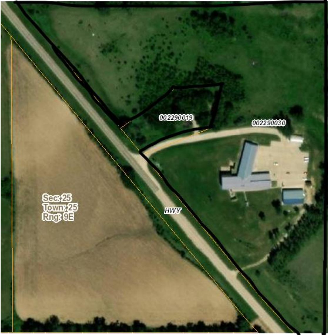
Macy Campus Geography