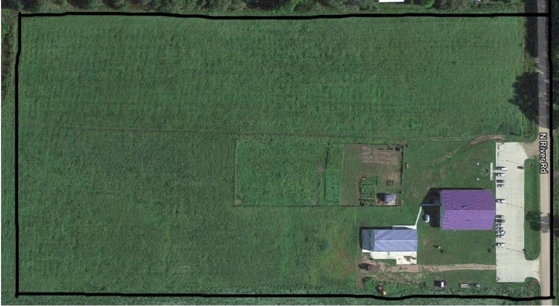
Santee Campus Geography